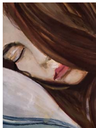
The Gaze 40 x 32 cm

Coloured crayon on paper 30 x 21 cm and 40 x 32 cm Price: €1.200 per portrait