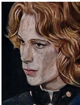
Tadzio 30 x 21 cm