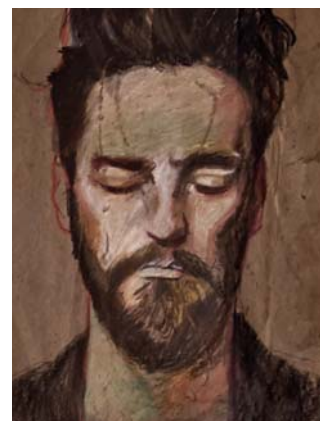
Marc 40 x 32 cm