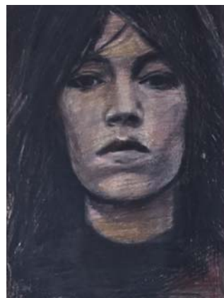
Ponsey 40 x 32 cm