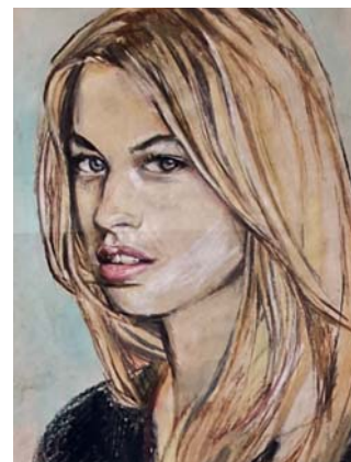
Patti 40 x 32 cm

Coloured crayon on paper 30 x 21 cm and 40 x 32 cm Price: €1.200 per portrait