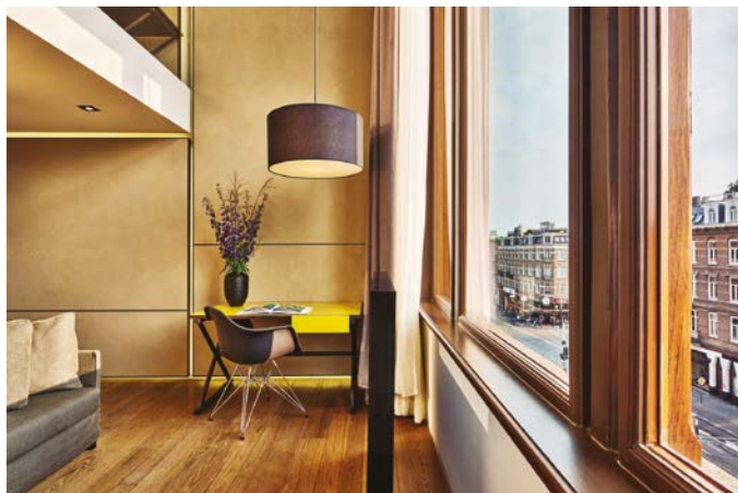
DELUXE GUESTROOM BEDROOM, DUPLEX GUESTROOM LIVING AREA, DELUXE GUESTROOM BATHROOM