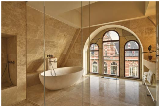
PENTHOUSE SUITE LIVING AREA, CONCERTO TWO BEDROOM SUITE BATHROOM AND MASTER BEDROOM