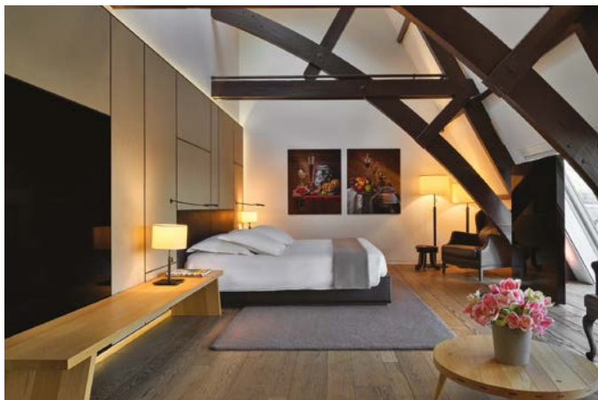
GRAND JUNIOR SUITE LIVING AREA, ROOFTOP SUITE BATHROOM GRAND JUNIOR SUITE BEDROOM