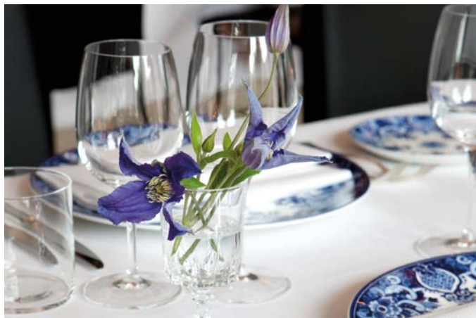
SYMPHONY ROOM, YELLOW ROOM